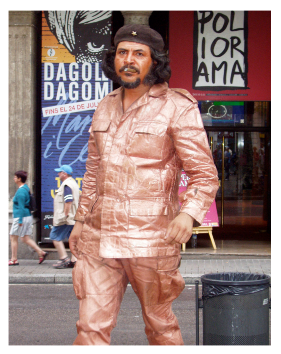
Street performer in Barcelona.

icons used by marketing and publicity machines, and by Bernal himself. The conflation conjures up a new set of political connotations for Latin American film, politics, and the historical relationship between the two. The body of Che Guevara, already invested with politics, creates a media body politic. Precedents for this process lie for example in the figures of Ghandi, the Indian bandit-turned politician Phoolan Devi, and Christ. Diarios brings forward the internationalist impulse of Che Guevara's time. At work here is a process of re-articulation