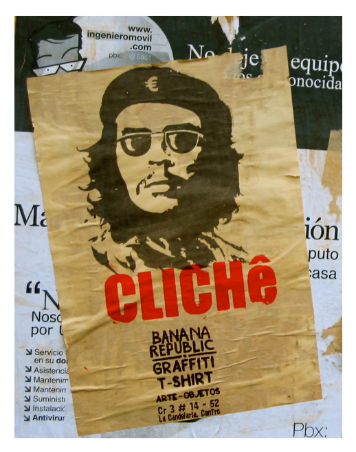
Street poster in Bogotá, Colombia.

circulate as images in the popular imagination, through the arts, the press, and fashion magazines to be appropriated in consumer culture. Guevara's image now circulates also as the image of García Bernal. His description of himself as "only a man" is a counterpoint to those who wanted to destroy him. Reducing his own stature to that of an ordinary man bridged the distance between his exceptional life and that of his followers. It bestowed heroic status on the common man, echoing one of the central themes in his ideas: the common man shall make the Revolution; he shall become a new man. The photograph